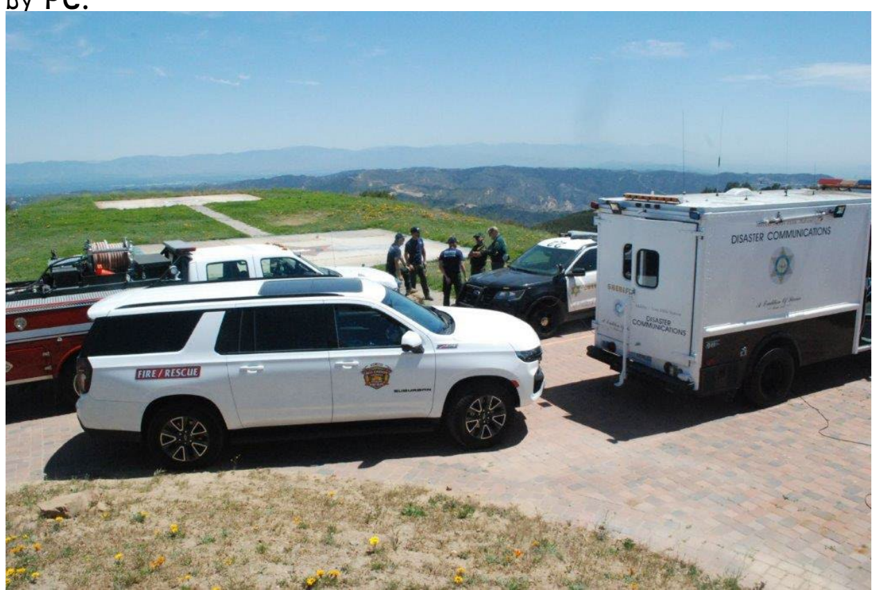
View from 69 Bravo with DCS-22 along with personnel from Bell Canyon Fire Brigade and others from areas burned during the Woolsey Fire.

You might want to read the instructions that came with your radios to become more familiar with how they are programmed by hand and by PC.